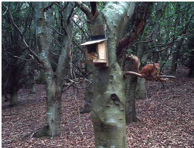
Squirrels' movements captured by the Wildlife Cameras funded by the Community Company